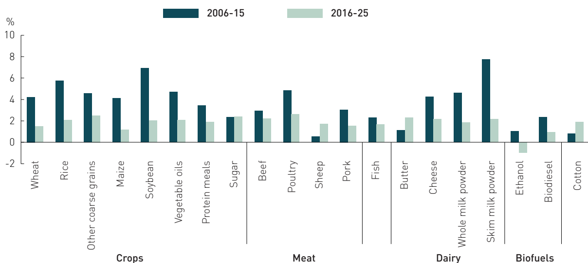
Figure 3. Growth in trade by commodity Annual growth in volume terms

In addition, there are several policy uncertainties. One relates to China's recently announced changes to its grains policy, including the setting of domestic prices and the management of stocks. The current Outlook assumes that those changes will enable China to meet its domestic objective of maintaining a high self-sufficiency ratio in maize without severely disrupting international markets. However, the timing and scale of stock release is a major uncertainty underlying the projections. A further risk relates to the Russian import ban, which is assumed to expire at the end of 2017.